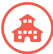
Head of Institutions